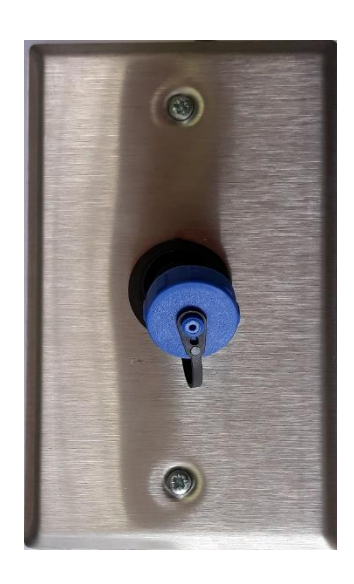
VP8231 for US J backbox (114mm x 70mm)