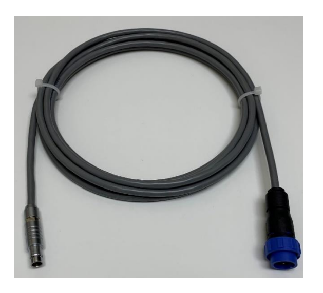
VC8211-02:Cable from iVAS VS8501 to Faceplate (2 metres long)