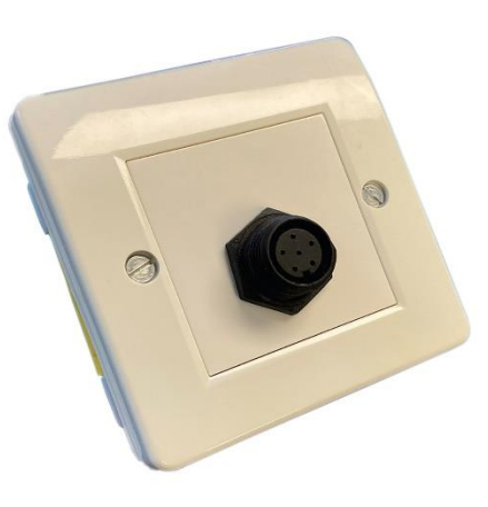
VP8221 for UK backbox (86mm x 86mm)